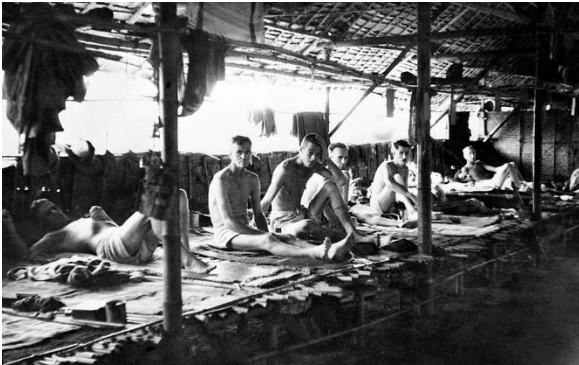
Prisoners housed in Bamboo Huts

Finally, after the march we were housed in bamboo Huts.