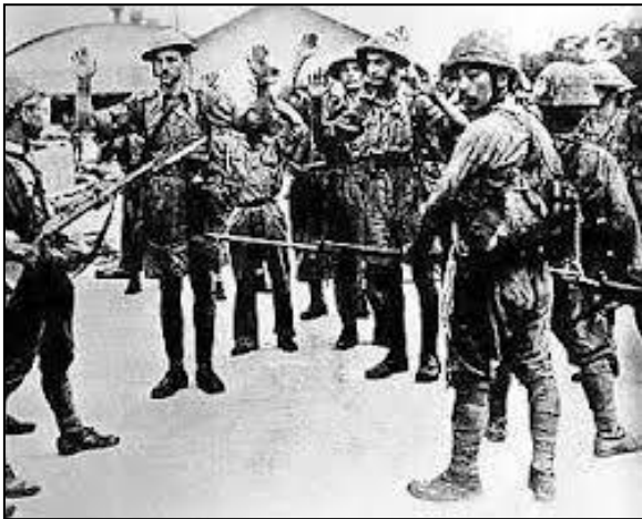
The British surrender to the Japanese on 15 th February 1942