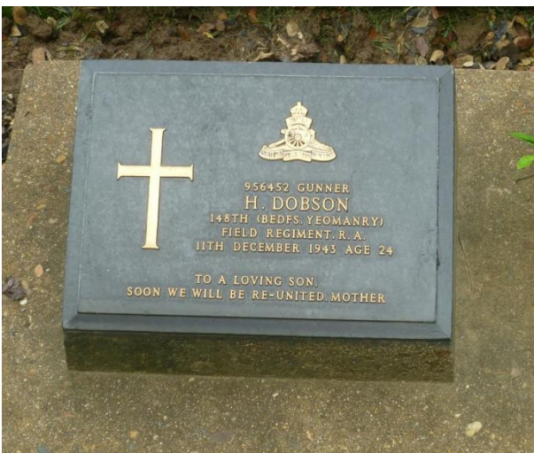
Kanchanaburi War Cemetery, Thailand