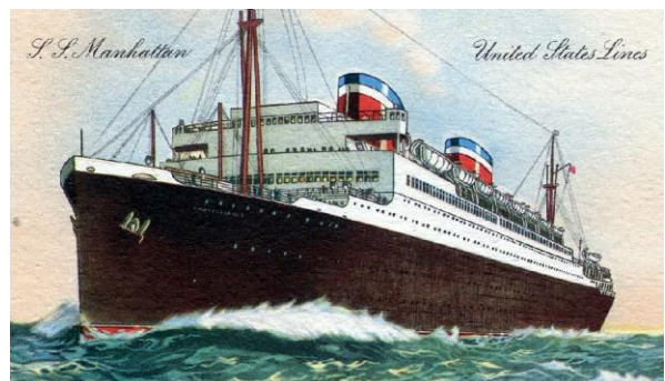
USS Wakefield (formerly SS Manhattan)

They were escorted by both British and American destroyers, although America was not yet at war, during the crossing of the Atlantic to Halifax, Nova Scotia. They travelled onward on the USS Wakefield, with a stop at Trinidad, to Cape Town, arriving on 8 th December 1941 the day after the Japanese attack on Pearl Harbour.