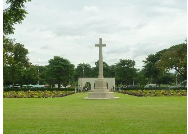
Kanchanaburi War Cemetery

The graves of those who died during the construction and maintenance of the Burma-Siam railway (except for the Americans, whose remains were repatriated) were transferred from camp burial grounds and isolated sites along the railway into three cemeteries at Chungkai and Kanchanaburi in Thailand and Thanbyuzayat in Myanmar.