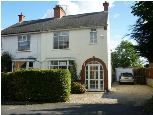
18 Flamville Road