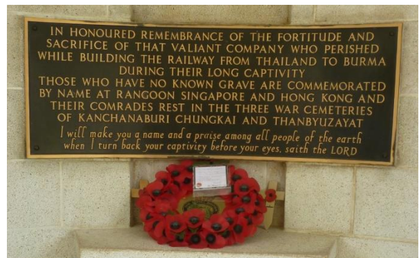
Plaque in remembrance of those who died during captivity in the Far East

Kanchanaburi War Cemetery is only a short distance from the site of the former 'Kanburi', the prisoner of war base camp through which most of the prisoners passed on their way to other camps. It was created by the Army Graves Service who transferred to it all graves along the southern section of railway, from Bangkok to Nieke.