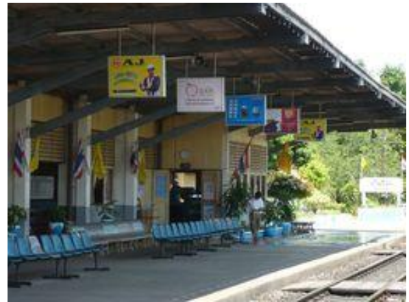
Ban Pong Station, Thailand

The Japanese had taken most of Malaya by this time and where only 30 miles away, and following the water supply being cut to the garrison and Singapore residents, Lieutenant General Arthur Percival, the Singapore commander, surrenders to the Japanese on 15 th February 1942.